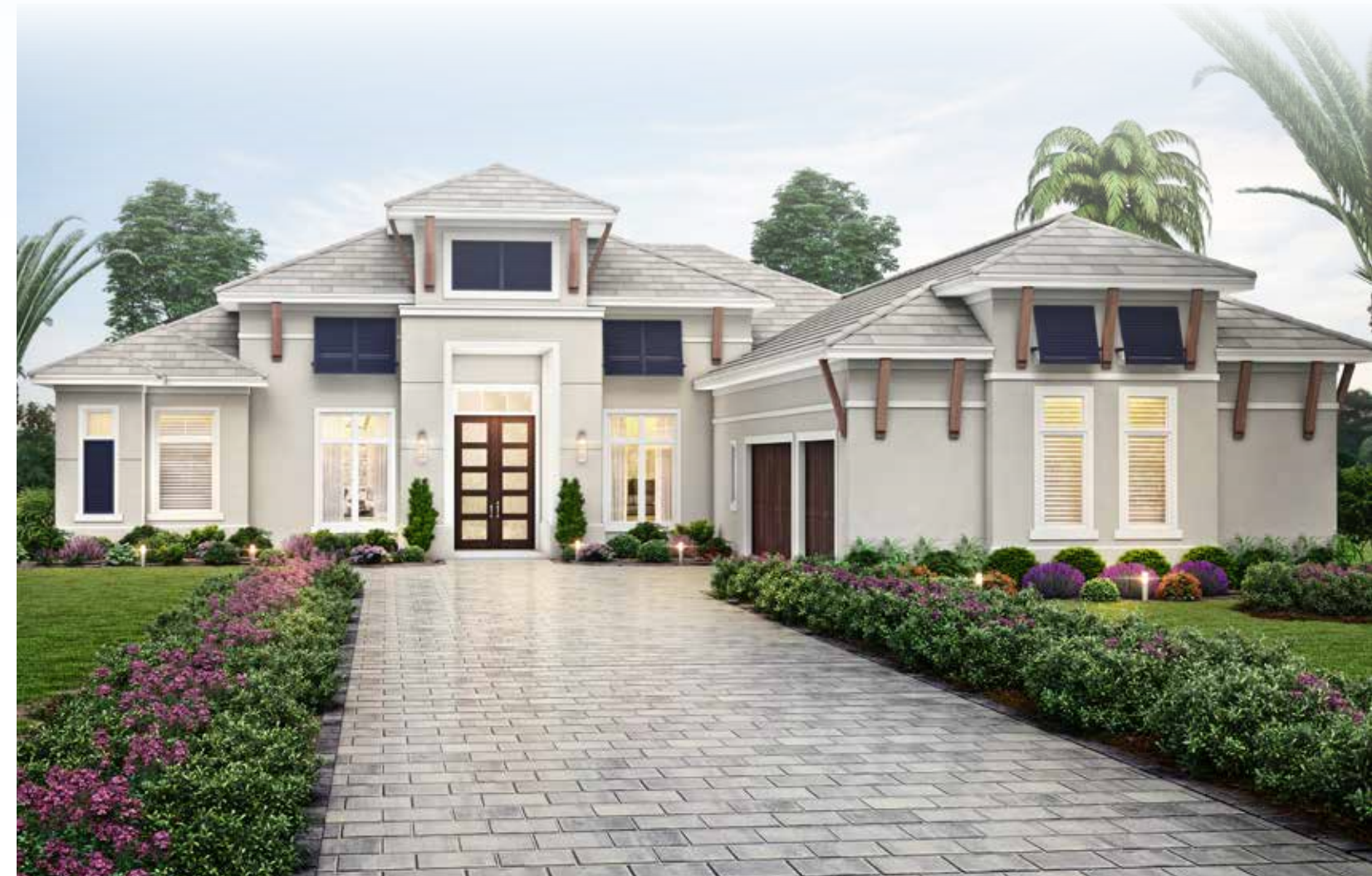
ESPLANADE LAKE CLUB • FORT MYERS, FLORIDA